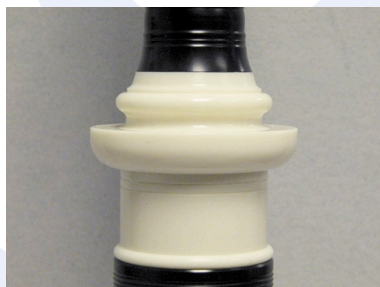
Imitation ivory projecting mounts with imitation ivory ferrules