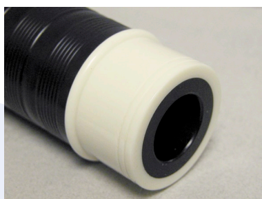
Imitation ivory ferrule