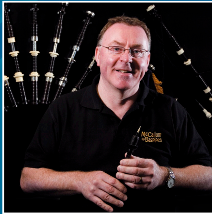
Designed by Willie McCallum

Available in Plastic or African Blackwood