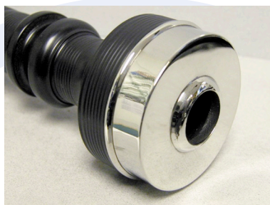
McCallum Alloy ringcaps