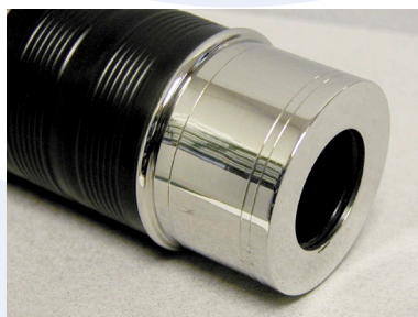
Closed beaded ferrule

Supplied as standard with small plastic projecting mounts, McCallum Alloy ferrules and ringcaps, plastic mouthpiece and McCallum Plastic Pipe Chanter