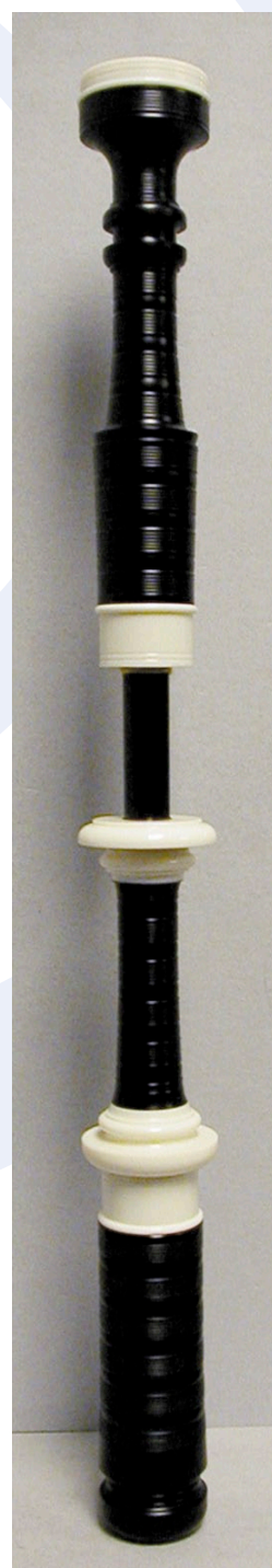
P3 Tenor drone

Supplied as standard with imitation Ivory projecting mounts, ferrules and ringcaps, a plastic mouthpiece and McCallum Plastic Pipe Chanter