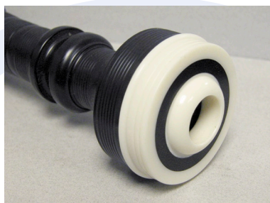
Imitation ivory ringcaps with imitation ivory bushes