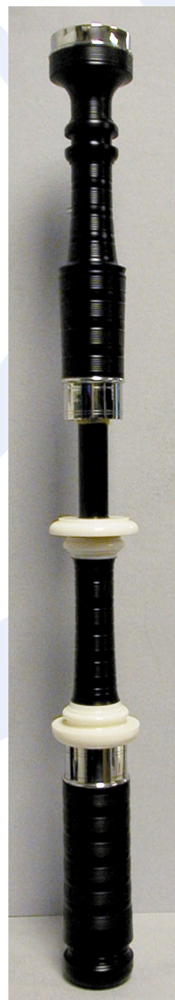
P2 Tenor drone

Supplied as standard with imitation Ivory projecting mounts, McCallum Alloy ferrules and ringcaps, plastic mouthpiece and McCallum Plastic Pipe Chanter