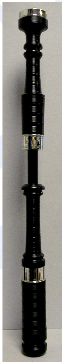
P1 Tenor drone