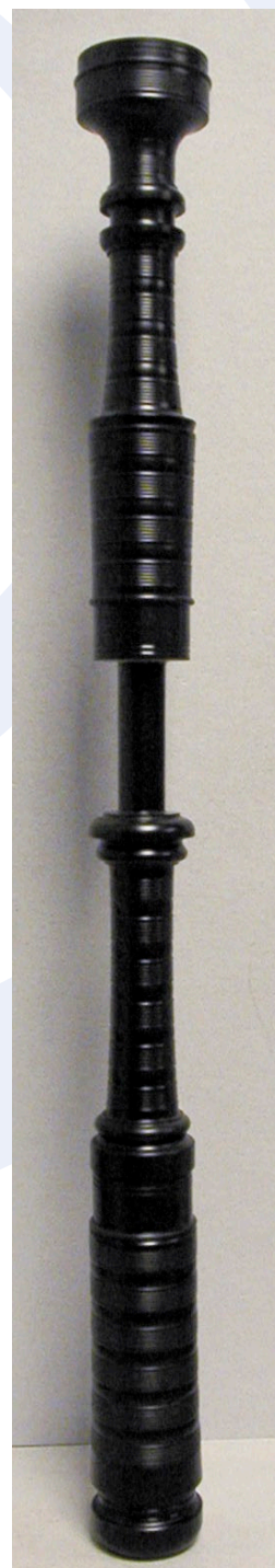
P0 Tenor drone