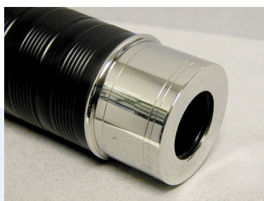
Closed beaded ferrule