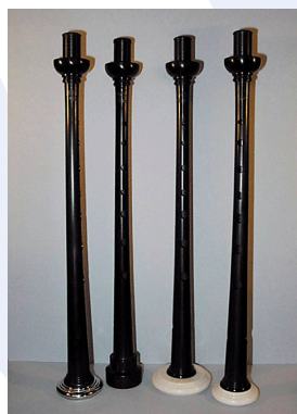
Plastic McCallum Pipe Chanter available with a selection of soles