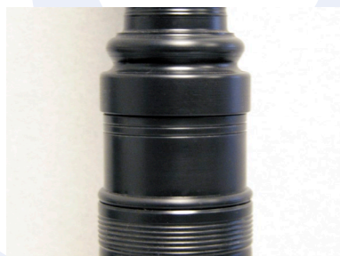
Small projecting mounts with beaded plastic ferrules