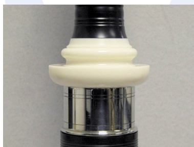
Imitation ivory projecting mounts with beaded McCallum Alloy ferrules