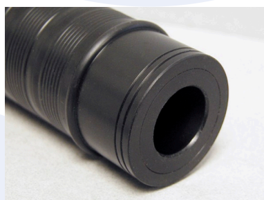
Closed beaded ferrule

Supplied as standard with small plastic projecting mounts, plastic ferrules, plastic ringcaps, plastic mouthpiece and McCallum Plastic Pipe Chanter