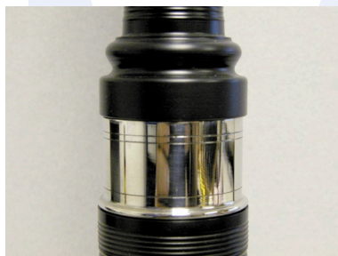
Small plastic projecting mounts with beaded McCallum Alloy ferrules